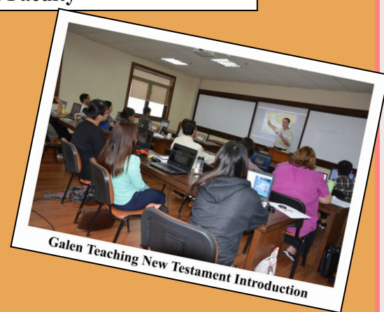
Galen Teaching New Testament Introduction