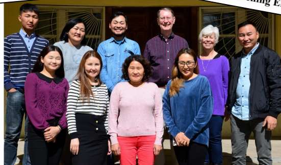
New Testament Theology Students in Mongolia