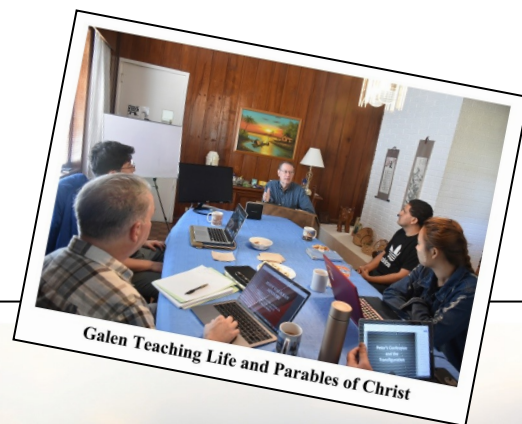
Galen Teaching Life and Parables of Christ