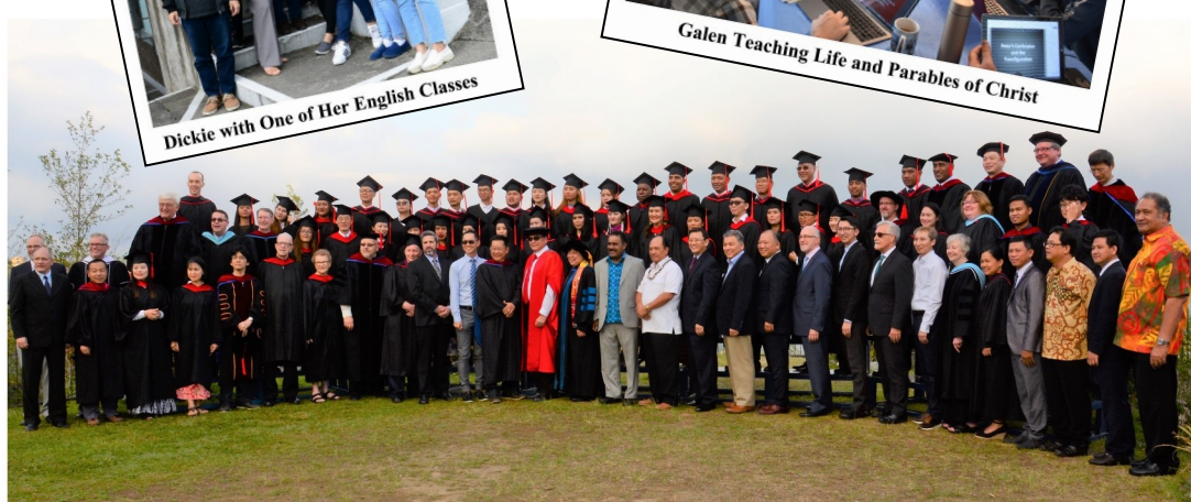
Graduates, Faculty, and Board